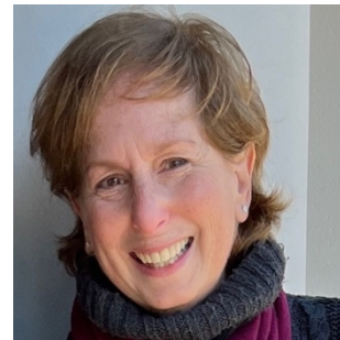
Ellen Blum Barish Writing for Wellness – The Healing Power of Personal Narrative